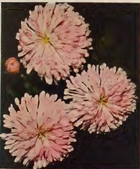
LOVELINESS SPOON. 60c each; 3 for $1.50

7 Sterling Spoons Truly the very best in spoon varieties 7 Sure-to-Bloom Plants $3.50 (1 of each pictured)